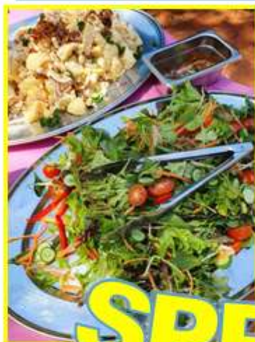
Some more photos of the Residents' BBQ

On Wednesday, 24th November we would like to encourage residents to come and sample the Summer Menu and give us lots of feedback. This is always well attended.